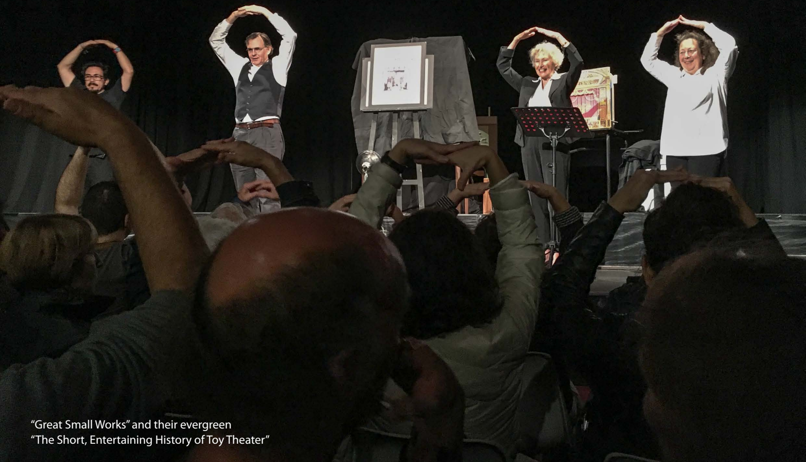
"Great Small Works" and their evergreen "The Short, Entertaining History of Toy Theater"