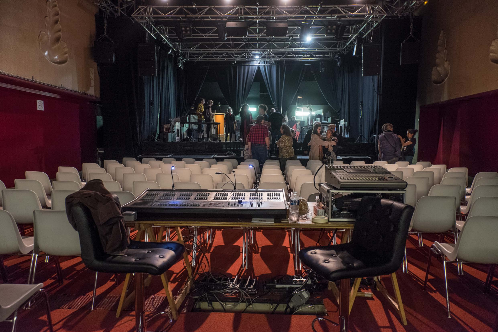
The former cinema hall "Le Forum", in the foreground the mixing consoles for light and sound