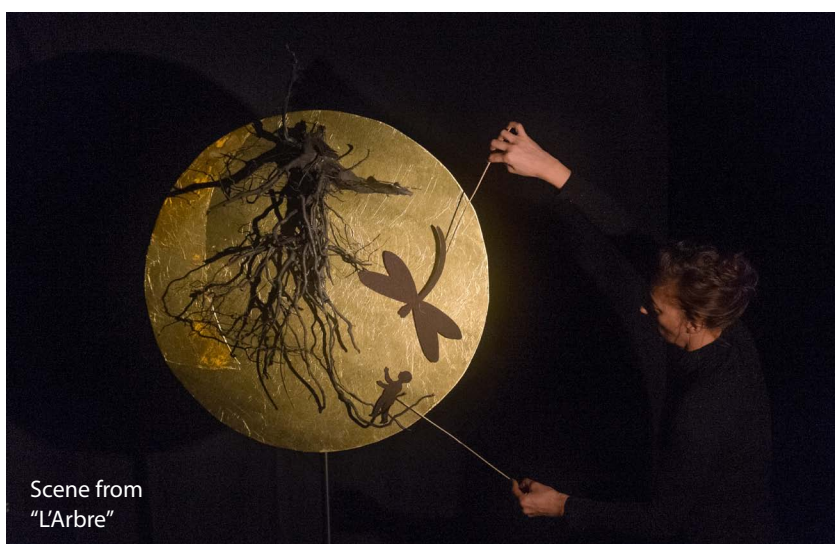
Scene from "L'Arbre"

ON MONDAY MORNING we saw a "Spectacle visuel and musical avec marionnettes": "L'Arbre" (The Tree), played by the "Compagnie Via Verde" from France. In the "Médiathèque Voyelles" we experienced the perfect venue: a compact stage, 140 comfortable armchairs in semicircular rising rows, and there was the feeling of closeness and immediacy that small theaters need.