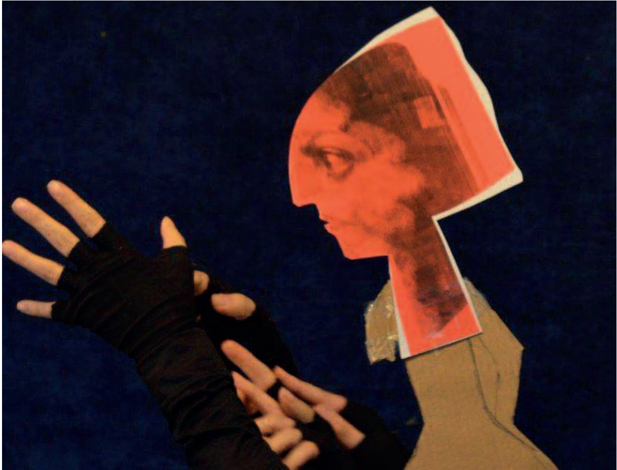
Detail view "La Poussière et la Couronne" – photo from the program booklet Audience on stage at the theater box of "Great Small Works"